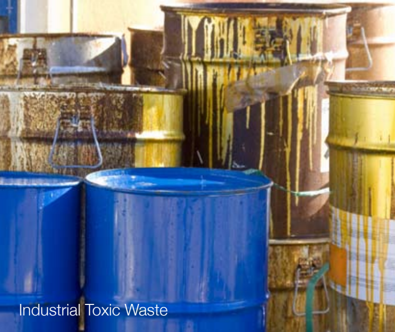
Industrial Toxic Waste