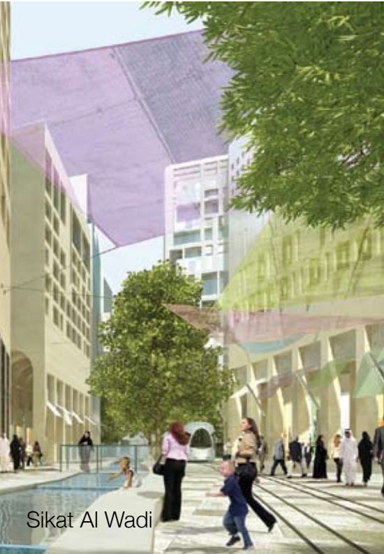
Sikat Al Wadi